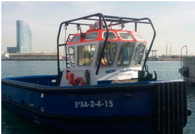
HARBOUR TUG TM-024-02