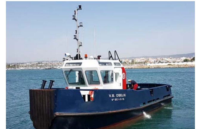
HARBOUR TUG TM-036-08