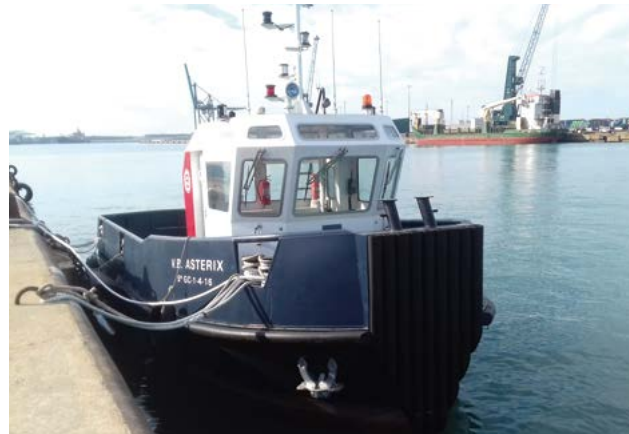
HARBOUR TUG TM-036-08